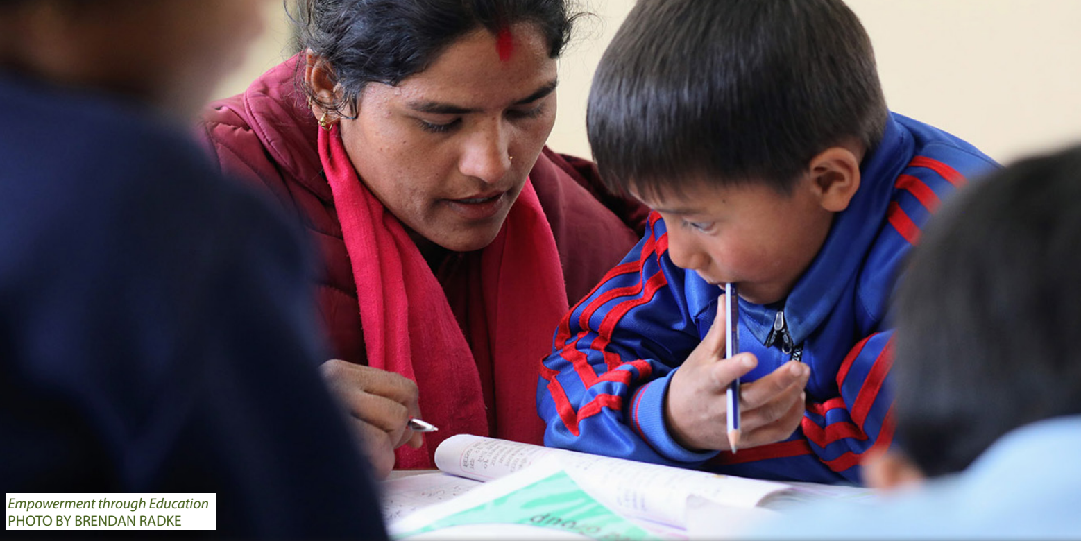
Empowerment through Education