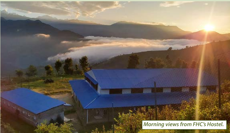
Morning views from FHC's Hostel.